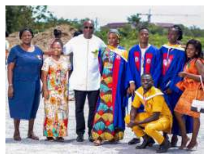
Graduation Day Winneba