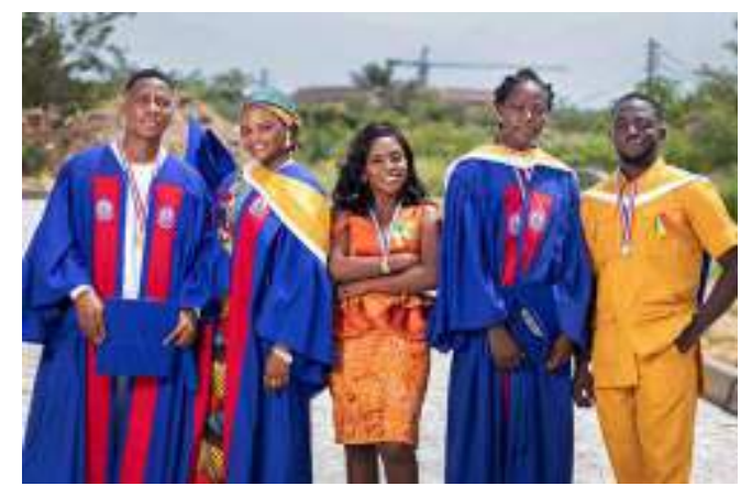
Five NS/PPRC Winneba Graduates