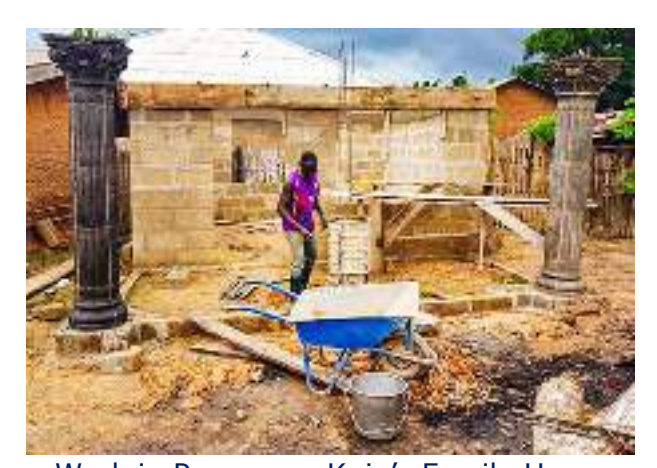
Work in Progress - Kojo's Family Home