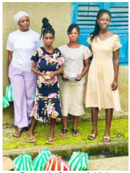
Enyinnda Outreach Visit

were also pleased about the visit and the food parcels during these very challenging times. The people expressed gratitude and joy at meeting the young team and assured them of their continued support. We all agree that the livelihood of our people needs to improve.