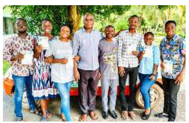
PPRC Staff - New Driving Licences

Recently, six PPRC staff members passed their driving test and were given their driving licences.