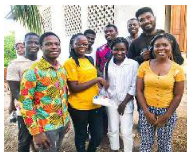
New Winneba Students