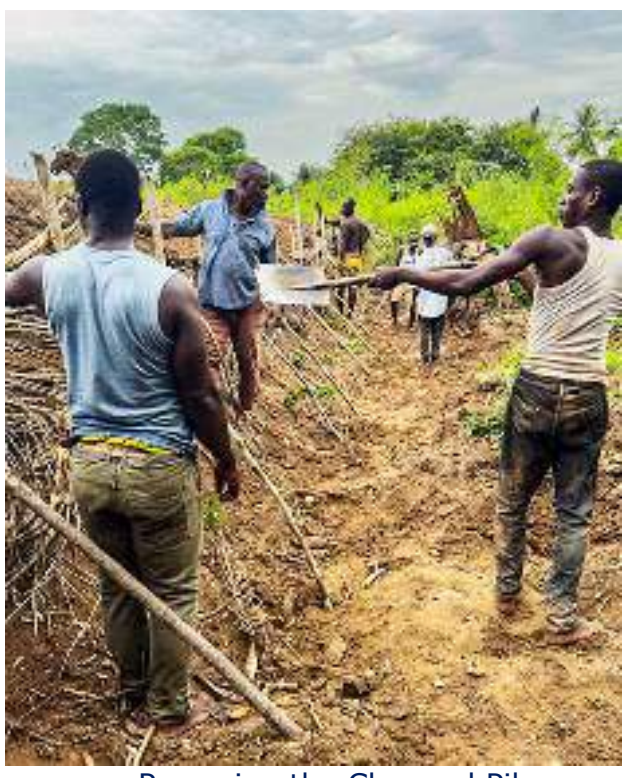
Preparing the Charcoal Pile