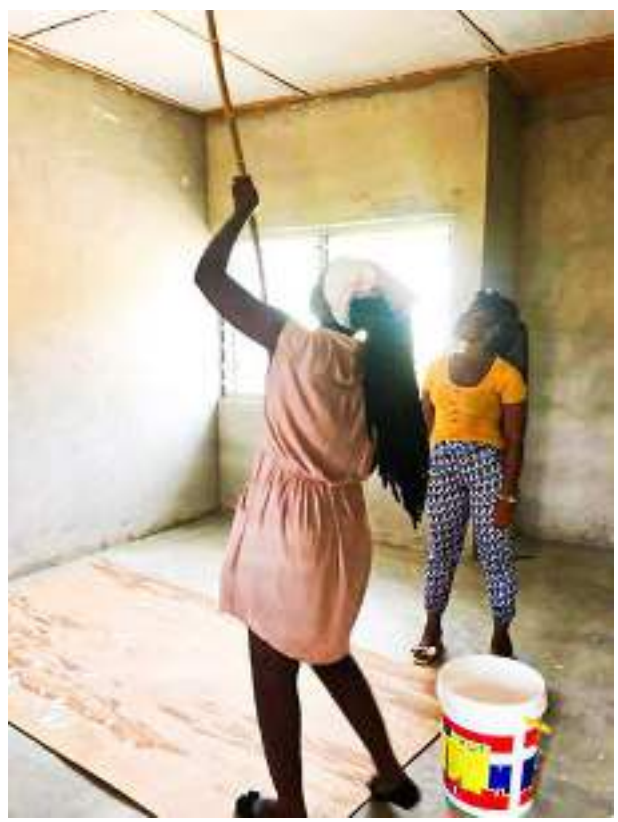
Student Volunteers Painting Twins' House

PPRC staff have been doing house-tohouse visits with the families in Enyinndakurom. The team believes this