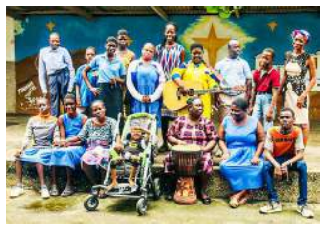
Greetings from St. Elizabeth's

We are seeking financial support to start this project; a medium-sized baking oven and related equipment are among the essential items required.