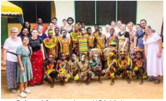
Cultural Immersion - USA Visitors

They stayed three weeks, did painting and games at St. Clare's and did artwork, music, and dance at St. Elizabeth's. We look forward to strengthening this relationship.