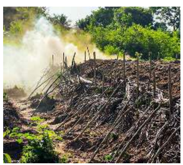
Charcoal Pile Smoldering

We recently took measures to reduce the use of plastic bags throughout the campus. Our access roads are deplorable due to the recent heavy rains and have become mostly pools and potholes. We urgently need to do something about this.