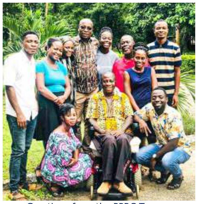
Greetings from the PPRC Team