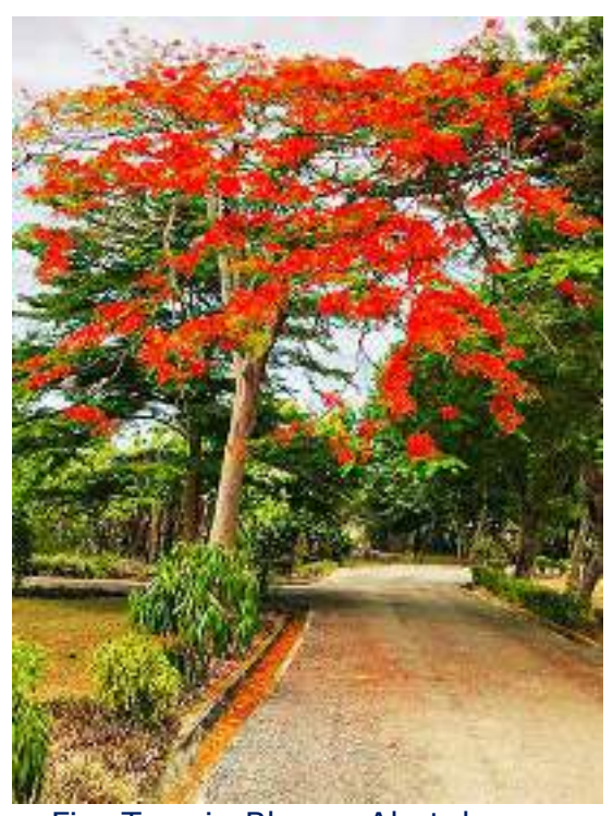
Fire Tree in Bloom, Ahotokurom

2023, it was 37.7%. Ghana is restructuring its debt as a condition for receiving an IMF bailout. The Ghana Cedi has fallen by ~50% against major currencies, and the price of motor fuel has trebled in the past 18 months. The only good news is that foreign donations now go further than before. Any contributions or fundraising would be greatly appreciated.