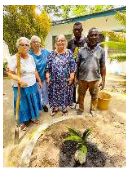
DMJ Sisters Planting Coconut Tree

lives over the years, and we are confident that the benefits of their efforts will continue to yield good results. We will work hard to maintain the DMJ charism and continue caring for the people 'for whom society says there is no place'. We are sorry to see them go and wish them well in their future ministries.