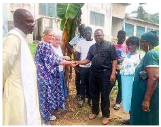
Twins' New House - Handover Ceremony

approach will help them quickly get to know the families and their situations. We will soon have some of our team members living among the people to enable us to provide well-informed and appropriate support services. Our team concluded their recent visit by providing forty food parcels for the residents, who