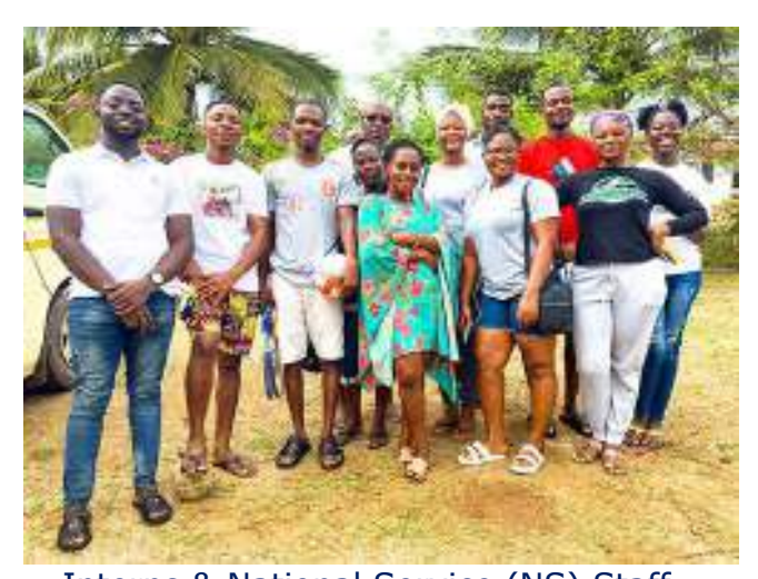
Interns & National Service (NS) Staff

Our staff are focused on teamwork and mutual respect for everyone involved. Our mantra is 'We are a Team!' as outlined on the T-shirt recently produced to celebrate this; see photo below.