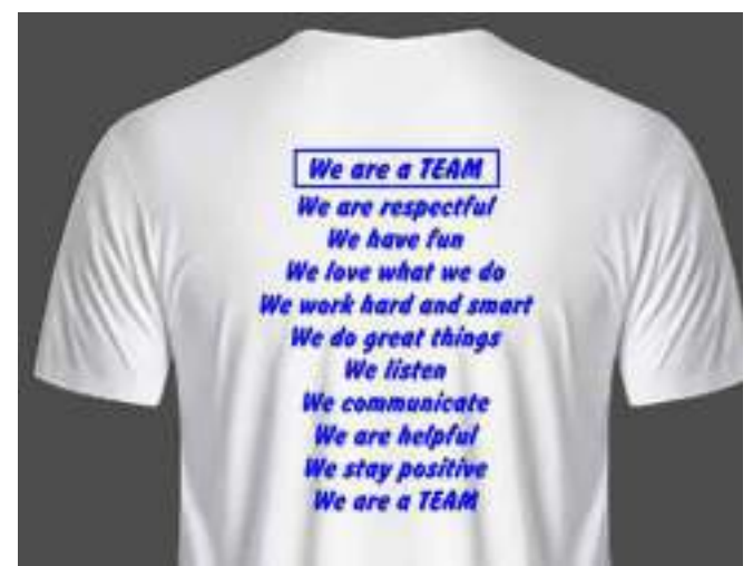
PPRC Staff T-Shirt

Our current NS personnel will officially complete their service in October, and we plan to hire some of them afterwards. The next six NS postings to PPRC will be in September 2023, significantly boosting our workforce. We are gradually building up a pool of professional staff. This will help us develop a robust and sustainable succession plan for the centre.