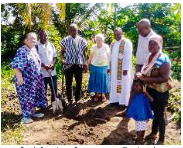
Sod Cutting Ceremony, Enyinnda

Our five current NS employees recently graduated from their degree courses at Winneba University. This was a proud day for everyone. They've been taking on lots of responsibilities and producing great results. We are so blessed to have these young people with us, and we'd have struggled recently without their help.