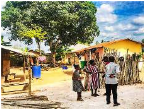
Visit to Kojo's Village